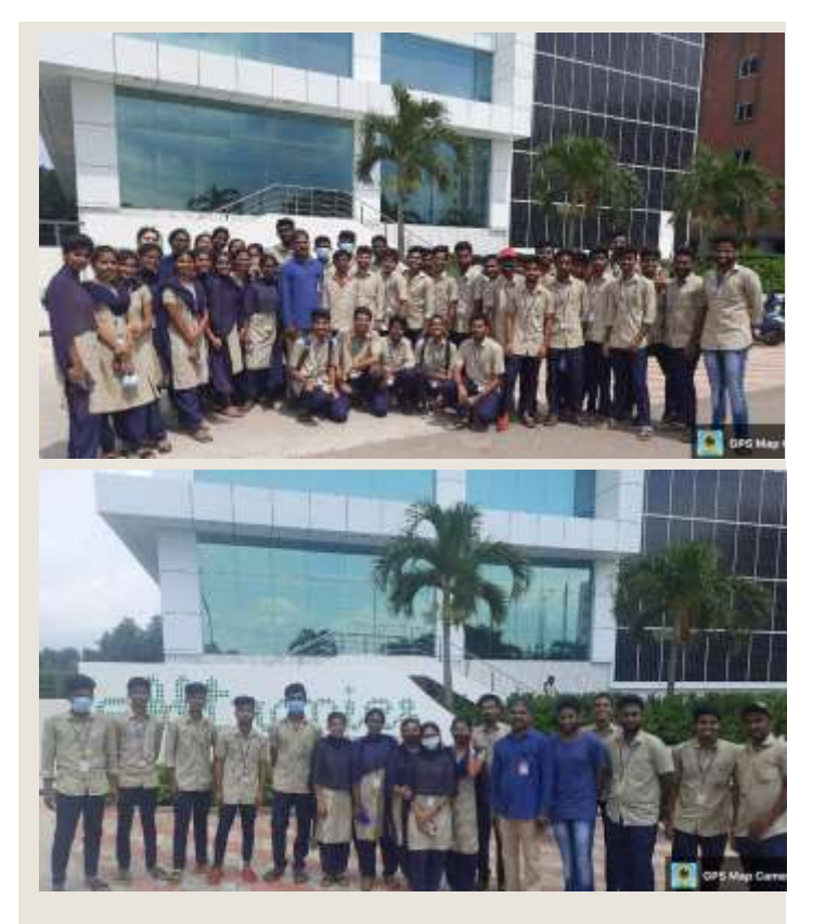
To explore practical application of theory, Second year students of Electronics department visited "Efftronics", APIIC IT park, Managalagiri.